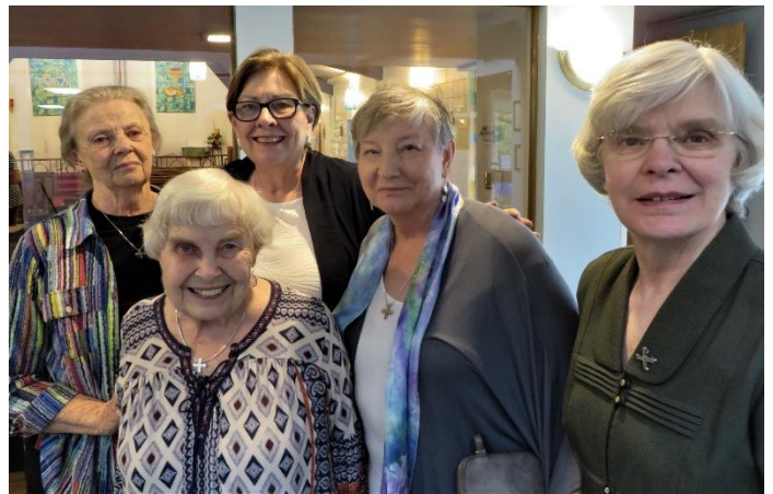
St. Bart's Daughters